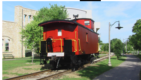
CPR caboose ready for John Galt Day – August 2008