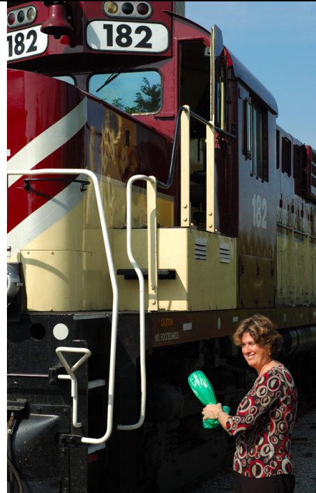
City of Guelph Mayor Karen Farbridge prepares to inaugurate the Guelph Junction Express with a bottle of champagne