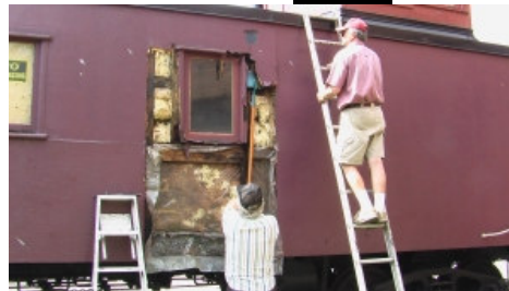
GHRA caboose undergoing surgery to replace badly rotted plywood – April 2008